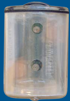
MODEL G2 White Lens with 2 green LEDs. Flash only.