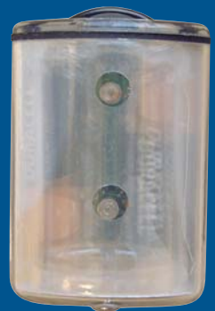
MODEL G3 White Lens with 2 blue LEDs. Flash only.