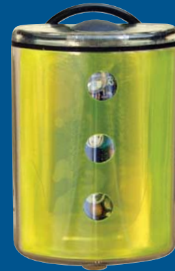
MODEL 2017 Push Button Activated. MODEL 2017A Push Button Activated Coast Guard Compliant. Green Lens. 3 amber LEDs in flashing pattern.

GRACE INDUSTRIES, INC. Solutions for Life Safety