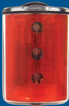
MODEL G1 Red Lens with 3 red LEDs. Flash only.