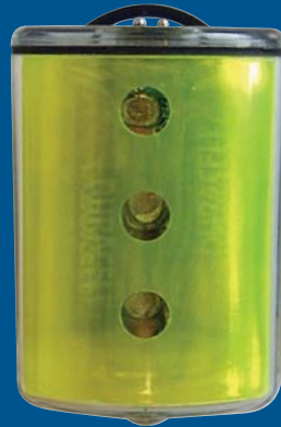
MODEL 2016 Water Activated. MODEL 2016A Water Activated Coast Guard Compliant. Green Lens. 3 amber LEDs in flashing pattern.