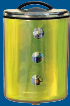
MODEL G Green Lens with 3 amber LEDs. Flash only.